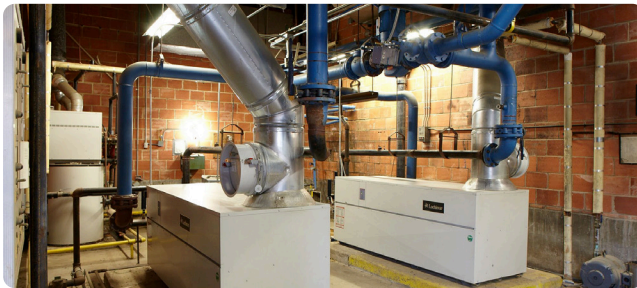
Dallas/Fort Worth 972-325-1919